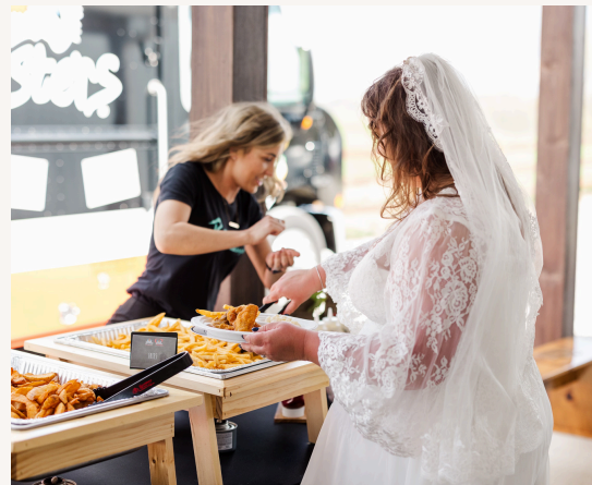
FOOD TRUCK CATERING