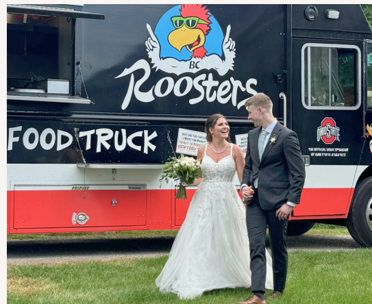
FOOD TRUCK VIBE