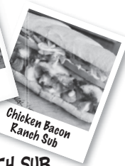
Chicken Bacon Ranch Sub