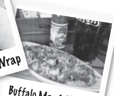
Buffalo Mac & Cheese