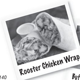
Rooster Chicken Wrap

A huge, battered piece of cod, fried and served with a side of tartar sauce. - 8.49 *960