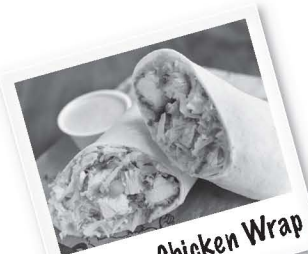
Rooster Chicken Wrap

Grilled or fried tenders rolled up in a fresh wrap with shredded lettuce, tomatoes and a blend of cheese. Served with Roosters Spicy Ranch or your choice of dressing on the side. - 7.99 *870-970