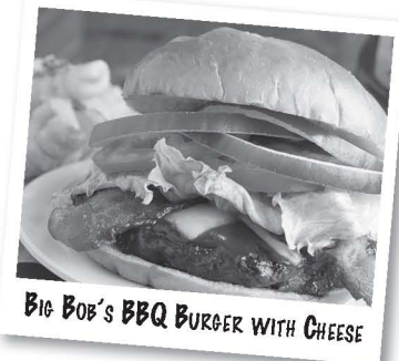
Big Bob's BBQ BURGER WITH CHEESE

This chicken breast took a bath in our homemade marinade before we tossed it on the grill. It's one of our favorites! - 6.59 *470