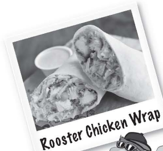
Rooster Chicken Wrap

Grilled or fried tenders rolled up in a fresh wrap with shredded lettuce, tomatoes and a blend of cheese. Served with Roosters Spicy Ranch or your choice of dressing on the side. - 7.99 *870-970