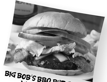
BIG BOB'S BBQ BURGER WITH CHEESE