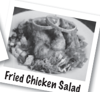
Fried Chicken Salad