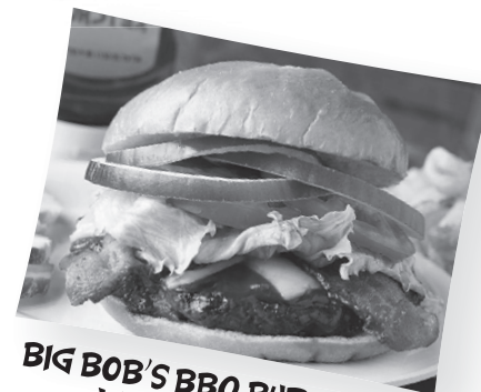
BIG BOB'S BBQ BURGER WITH CHEESE