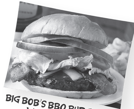
BIG BOB'S BBQ BURGER WITH CHEESE