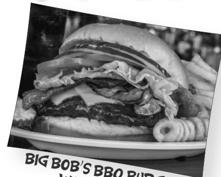
BIG BOB'S BBQ BURGER WITH CHEESE